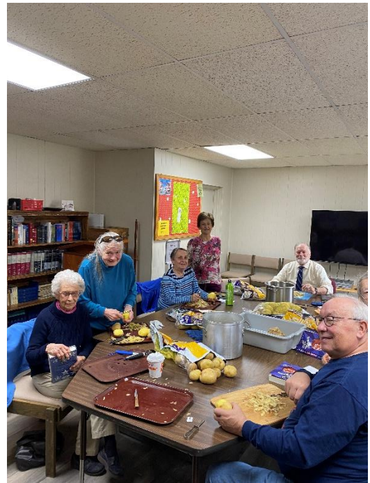
The Book Club peeled potatoes for the dinner while discussing Bill Bryson's novel.