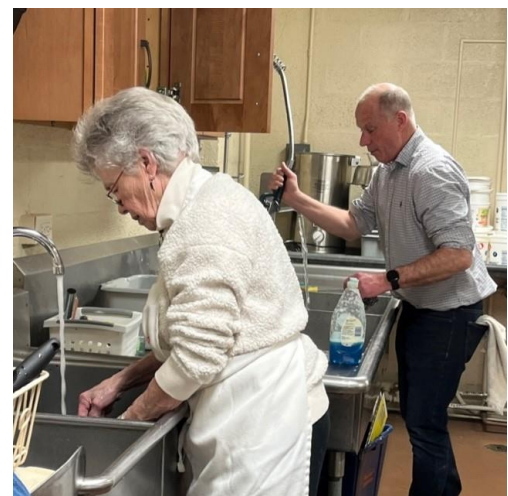
A great clean-up crew is a lot of help!